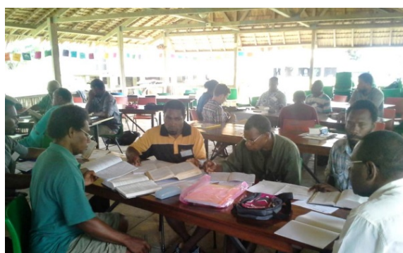
Getting into the Word at a Langham Preaching seminar

by asking all the questions above. Imagine you are there experiencing this passage. How does the author help us "see" the prayers of the saints reaching God? Is the passage and its context more alive to you now?