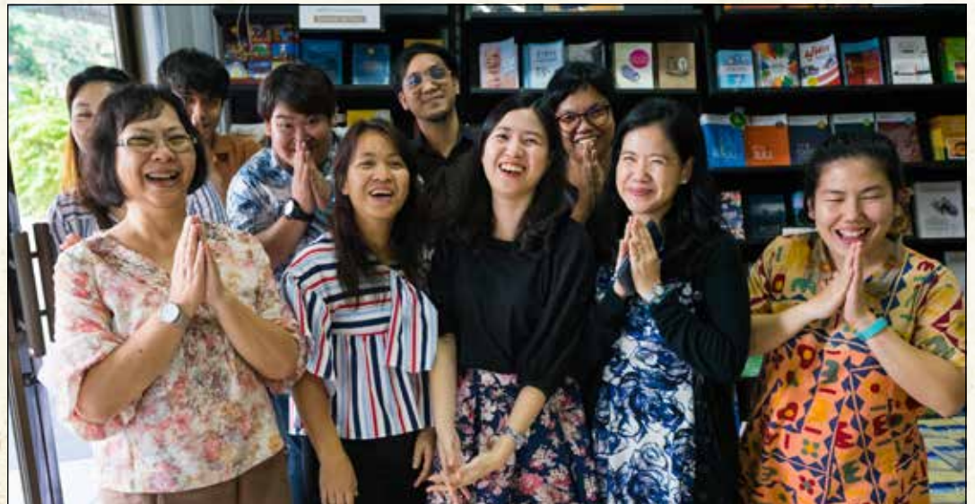
The Kanok Bannasan Publishing staff give a Thai welcome in their office in Bangkok.