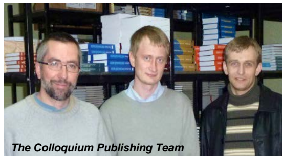
The Colloquium Publishing Team

Over the last 5 years Langham Literature has partnered with Colloquium to help them establish a sustainable publishing ministry in Ukraine. They focus on biblical studies and sell to seminaries, churches, pastors and individuals. Their current list of more than 80 titles in Russian and Ukrainian include translations as well as locally authored books. And believers across the region have come to trust Colloquium publications as books that stimulate helpful discussion, debate and writing on important topics for today.