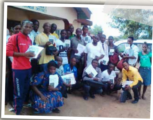
Preaching Program participants in Sierra Leone.